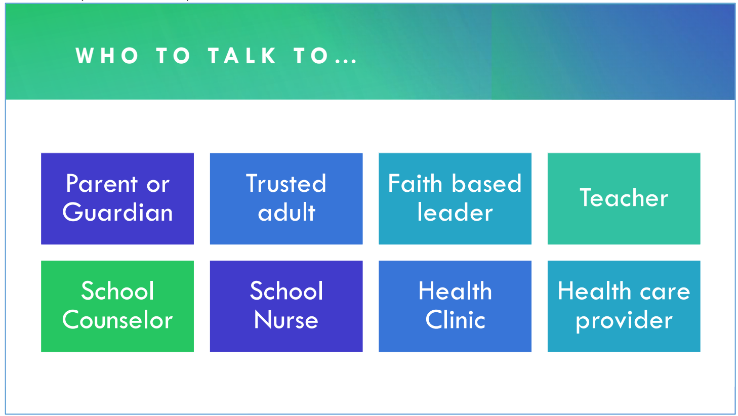
Slide 11: Local Resources-have students take a pic of the resources for future use.